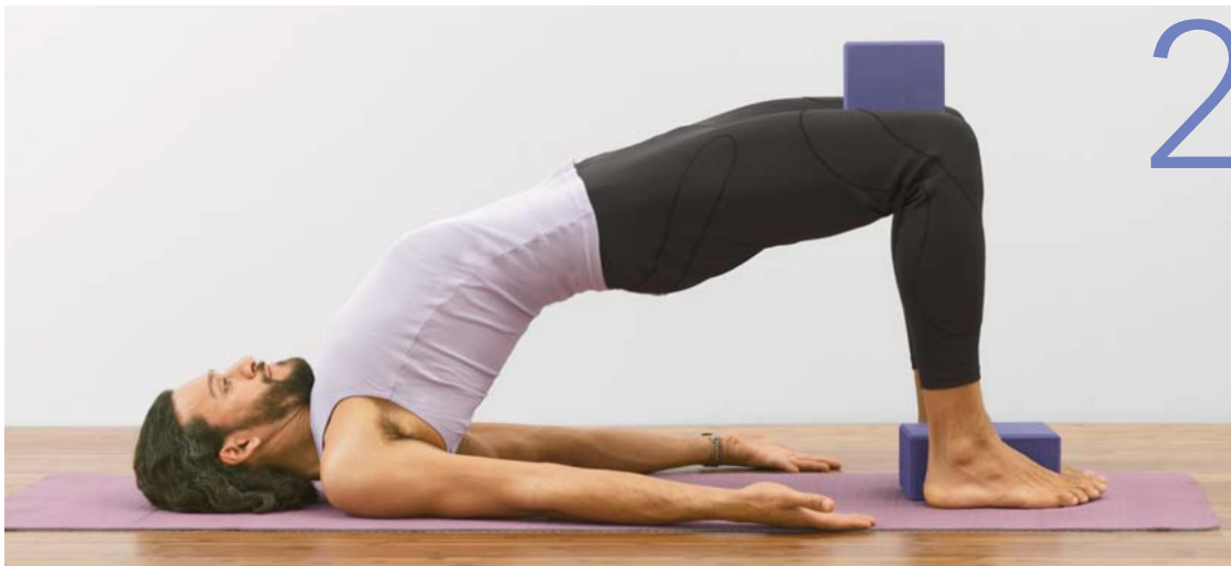
Figure 2 (variation of Setu Bandha Sarvangasana) is described on page 66.

The first variation, which is one of my favorites, is a restorative version that will open your thoracic spine, teach you several important actions, and relax you on a muscular and an energetic level. You can use this setup outside class when you feel congested or tight in your upper back.