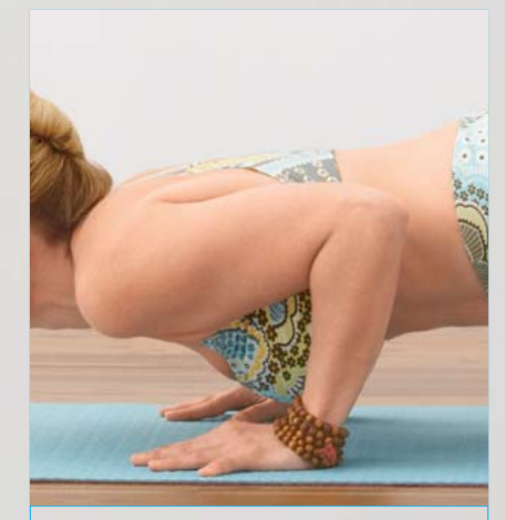
DON'T Dip shoulders lower than elbows.

Chaturanga presents different challenges for different bodies. It can initially be harder for women than for men. Men generally have stronger pectoral muscles than women and can use their power to muscle through Chaturanga. The key to making the pose doable for any body is to learn proper alignment. Correct alignment builds strength for those who struggle in that department and teaches the sturdier student, who often relies on brute force, to refine the pose in ways that prevent damaging the shoulders. Learn to set yourself up accurately, and you'll see